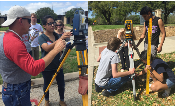
Civil Engineering students practice proper surveying techniques with City of Waco's Public Works employees.