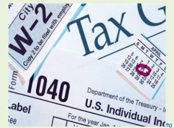
W-2 Forms for tax filing year 2011 will be available on February 1, 2012.