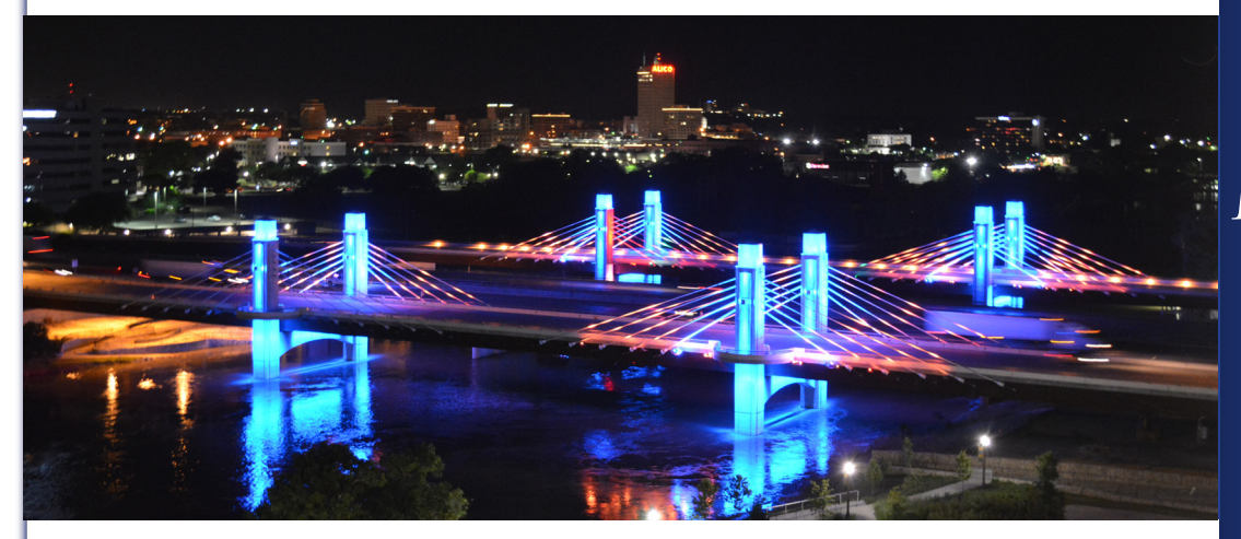
I-35 Bridge lights up blue and orange to celebrate MCC's 50th Anniversary on May 5, 2016

Another MCC Foundation year has come to a close, and what a year this has been! In addition to the many activities and fund development efforts that are part of every foundation year, this year included a grand tribute to McLennan Community College's 50 years of service to McLennan County.