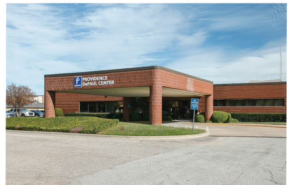
The DePaul Center , HOTR's only inpatient facility for low-income patients is operating just 18 of 48 beds because of costs and staffing.