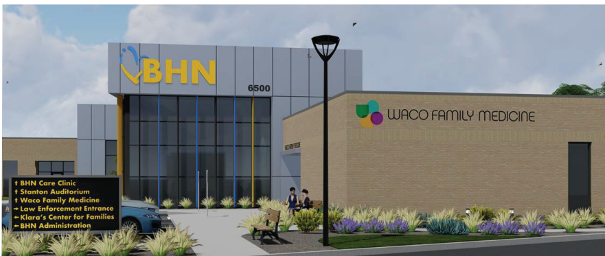
One piece of CBHS, the Crisis Hub , is a partnership between the region's LMHA and FQHC that will expand psychiatric support and minimize the time law enforcement spends on mental health crisis calls.