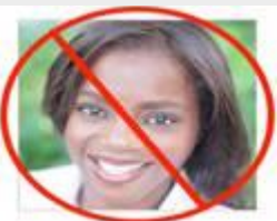
Colored background/head cut-off